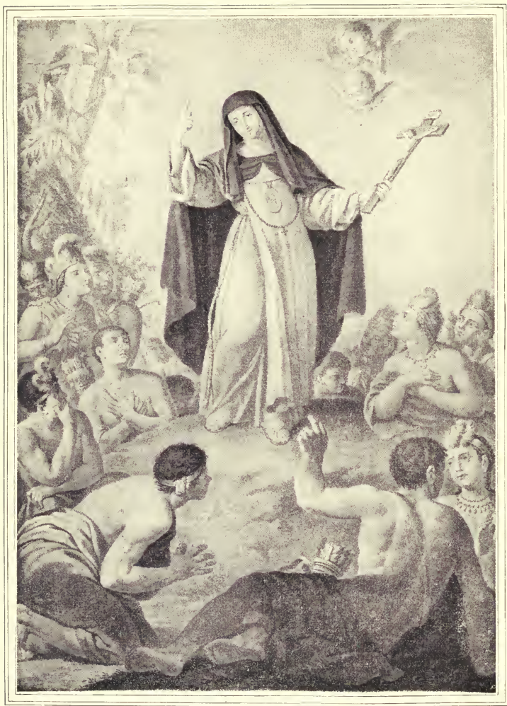
MARY OF AGREDA IS KNOWN TO HAVE BEEN FAVORED WITH THE MIRACLE OF BILOCATION: ALWAYS REMAINING IN HER CONVENT AT AGREDA, SHE WAS FOR A NUMBER OF YEARS THE FIRST MESSENGER OF THE TRUE FAITH SENT BY GOD TO THE INDIANS IN ARIZONA AND NEW MEXICO, U. S.