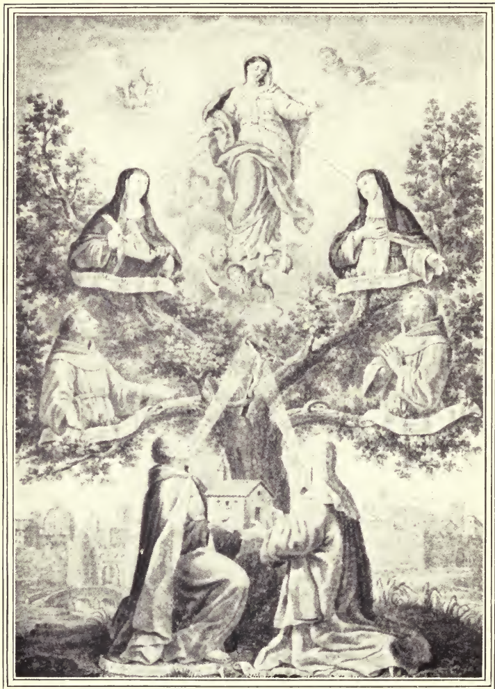
THE FATHER AND MOTHER, AS WELL AS THE TWO BROTHERS AND THE SISTER, OF MARY OF AGREDA ENTERED RELIGION ABOUT THE YEAR 1617.