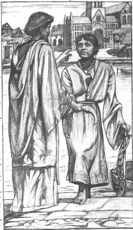
St Peter send a message concerning Westminster Abbey.