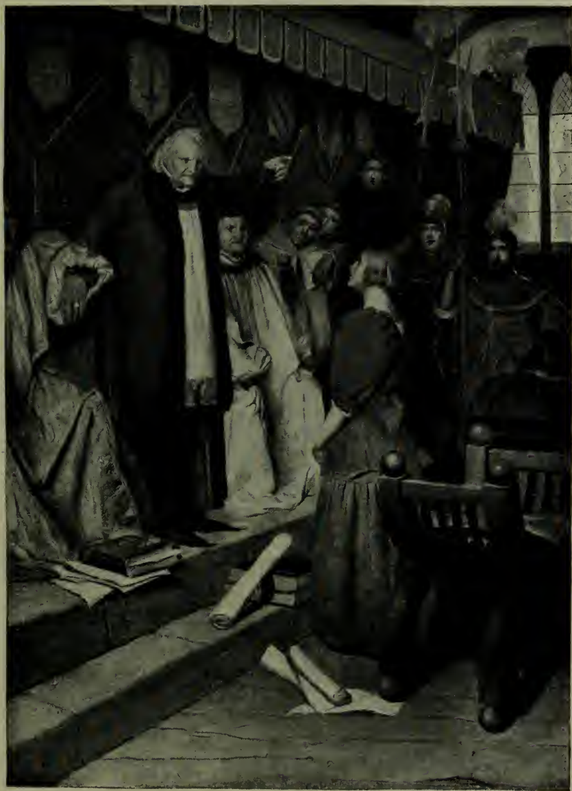
The Examination of Joan