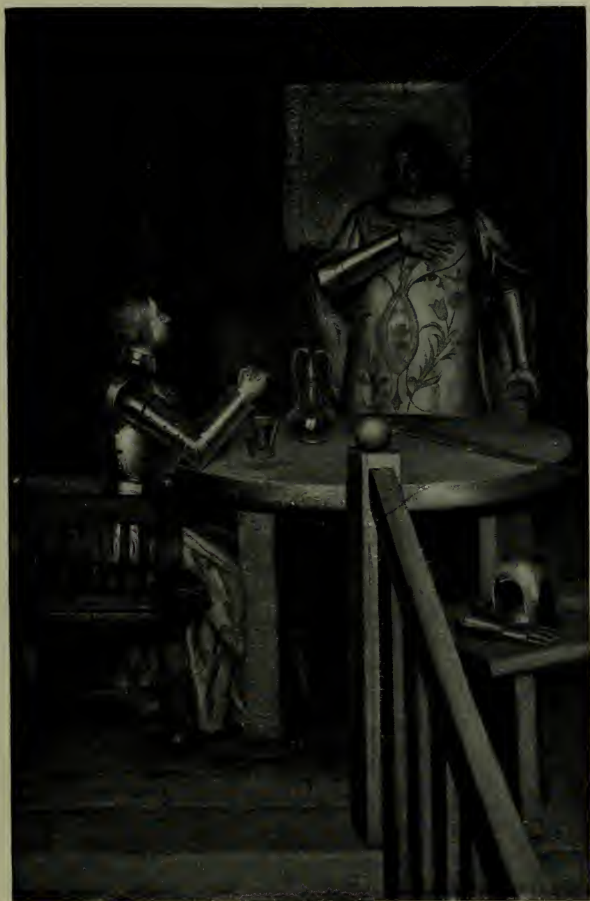
Joan and La Hire