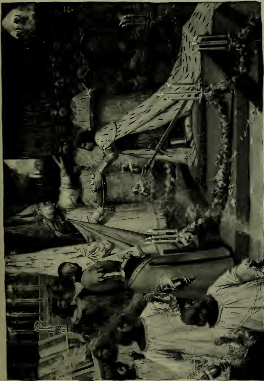
Coronation of the French King at Rheims