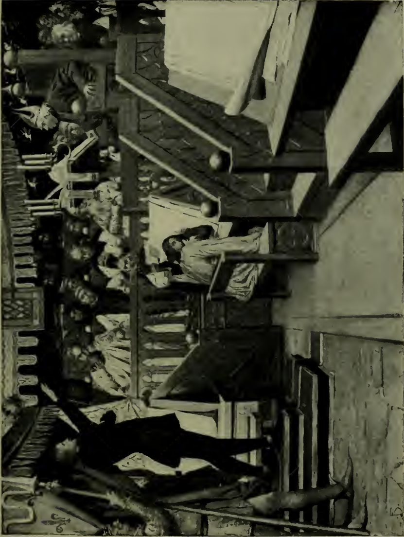
Trial of Joan of Arc