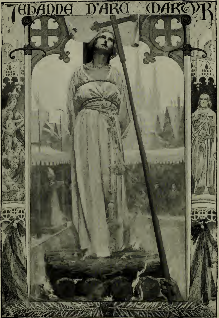
Martyrdom of the Maid of Orleans