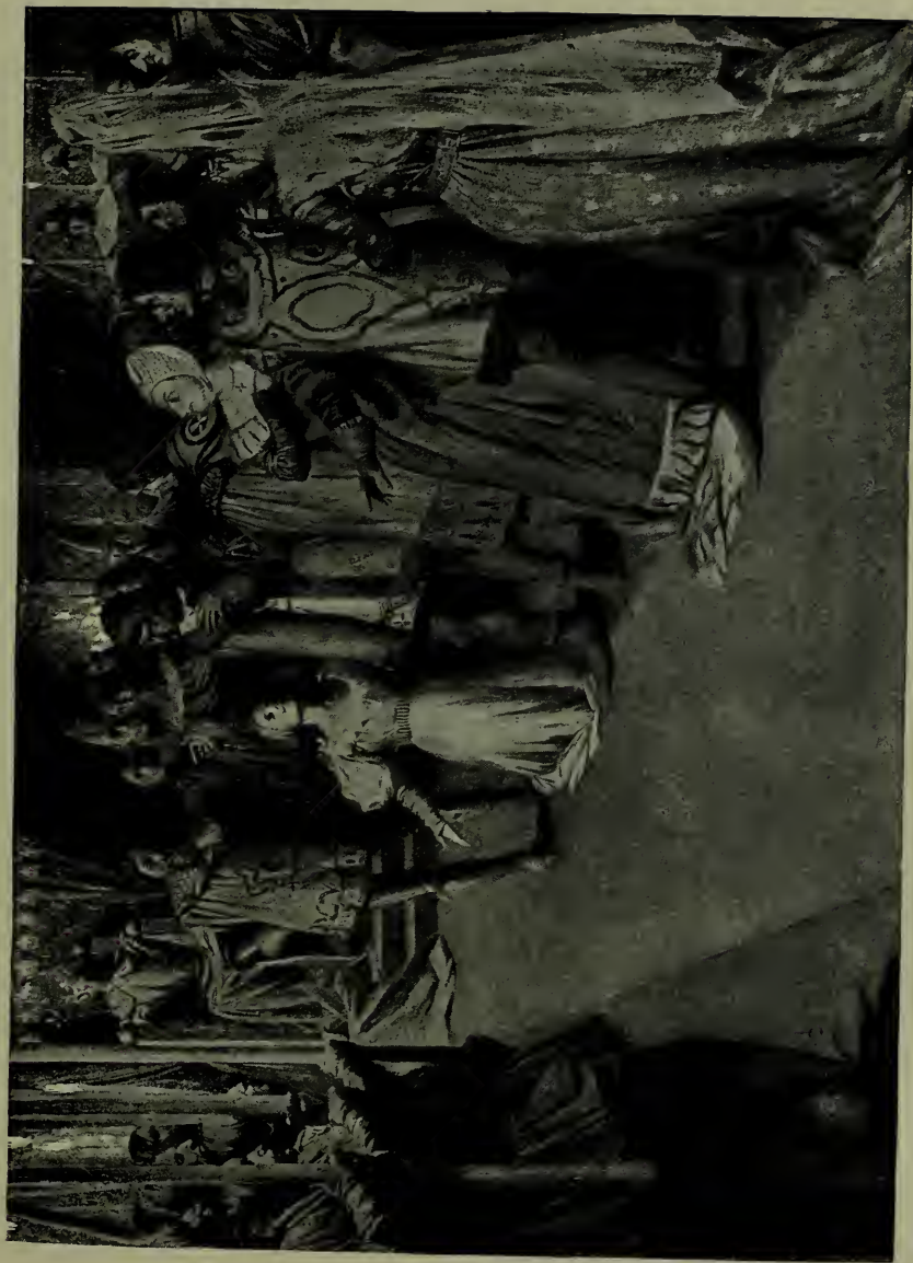
Joan discovers the disguised King