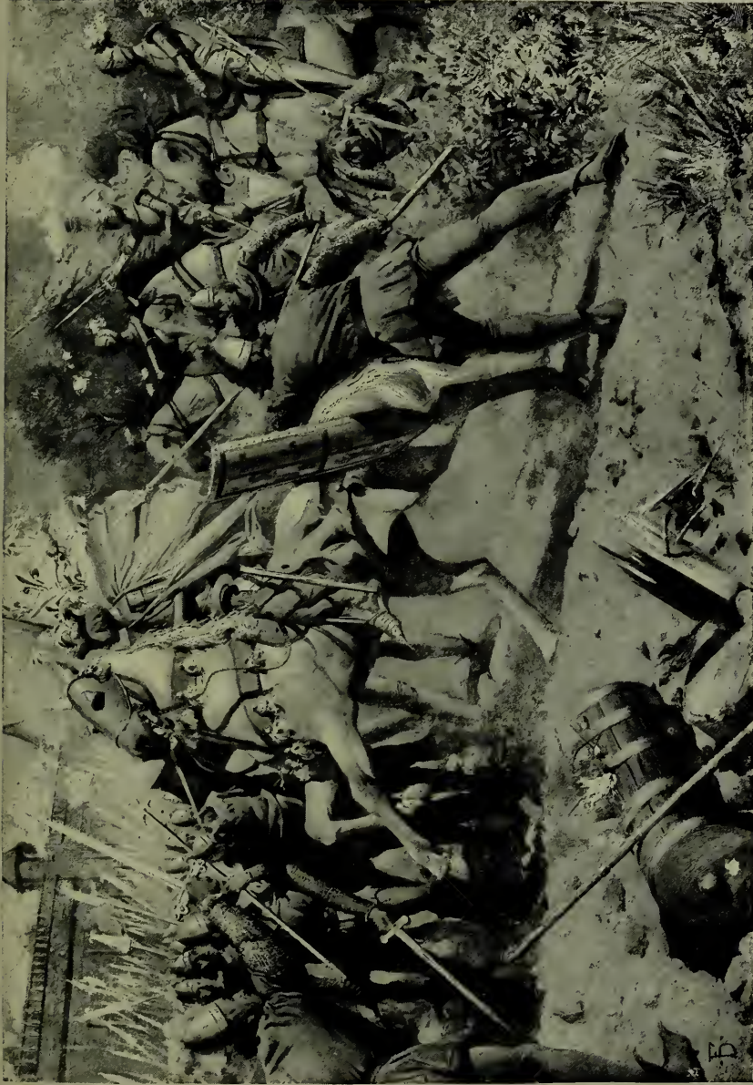
Capture of Joan at Compiègne