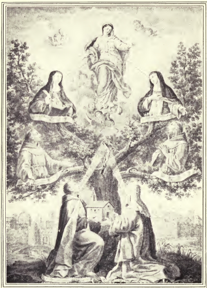
THE FATHER AND MOTHER, AS WELL AS THE TWO BROTHERS AND THE SISTER, OF MARY OF AGREDA ENTERED RELIGION ABOUT THE YEAR 1617.